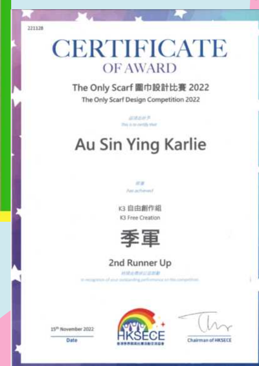
K3 Free Creation 2nd Runner Up