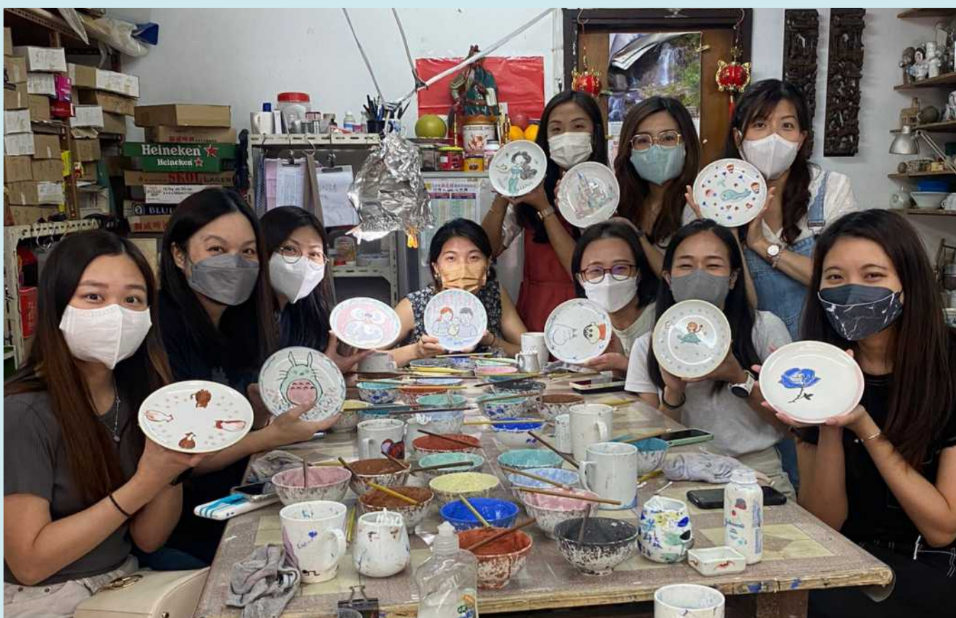
Teacher Development Day

Painting pastels and talking about parenting