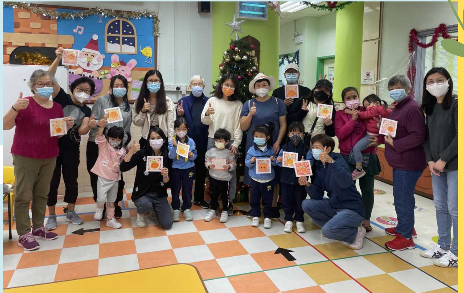
Pastel Nagomi Art Parents Workshop

It turns out that building blocks can be so much fun!